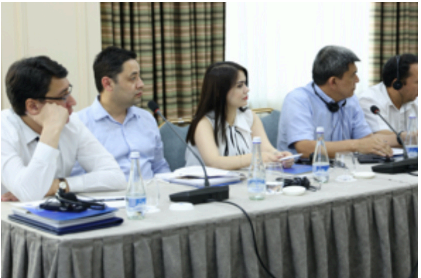
Some of the participants at one of the expert SPS workshops held in Tashkent in June 2023.

In the area of SPS, three workshops were held. Two five-day seminars looked into pest risk analysis and plant protection products regulation, respectively. The third was a four-day workshop on transparency mechanisms. It focused on setting up and operating an SPS National Enquiry Point (NEP) and a National Notification Authority (NNA) based on international best practice. Thirty-eight professionals from the San-Epidemiological Welfare and Public Health Committee, State Committee of Veterinary and Livestock Development and Agency of Plant Protection and Quarantine benefited from the workshops. More news on the workshops is available in this web story .