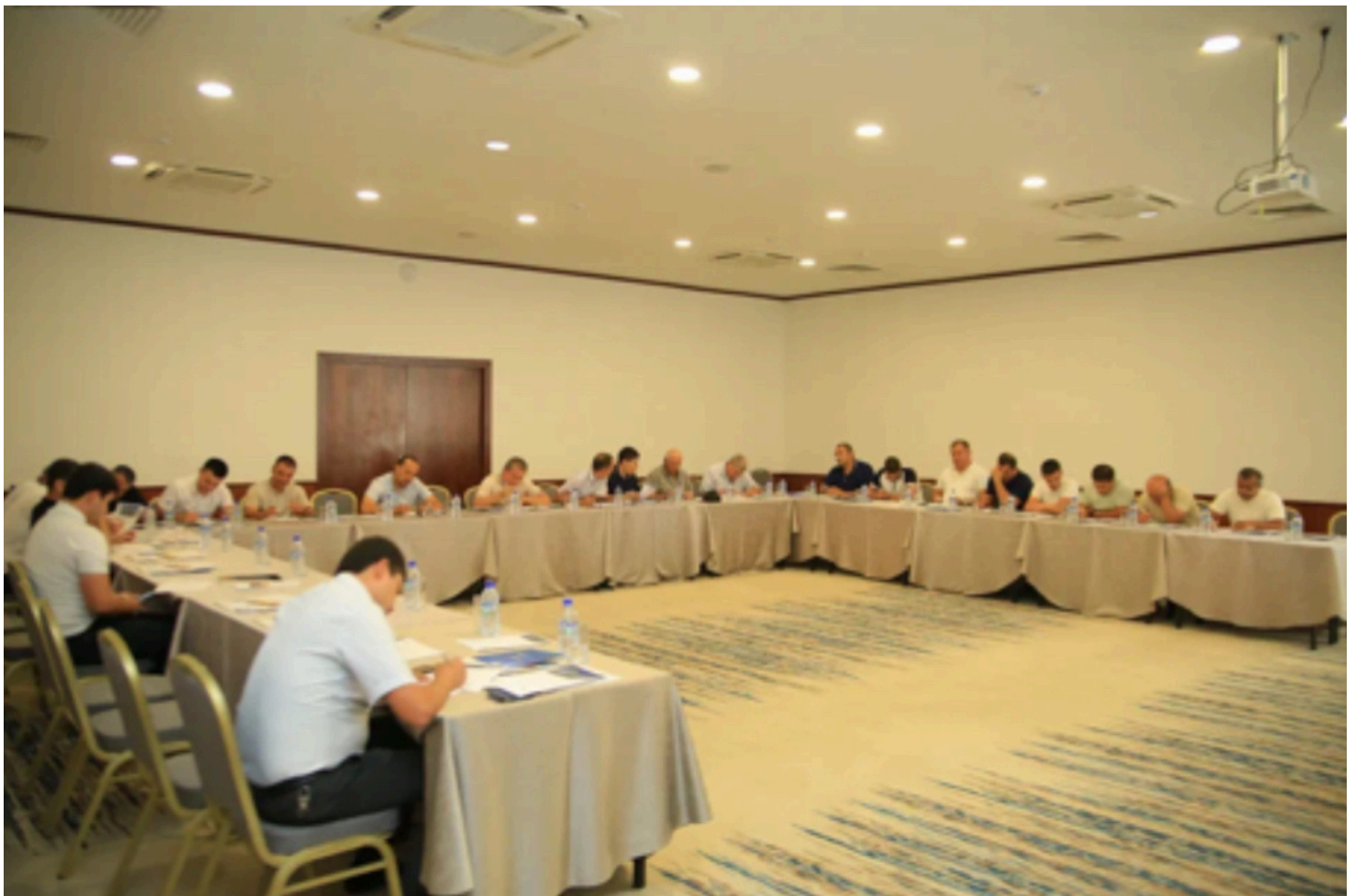
Private sector stakeholders at a workshop on trade in agriculture in Bukhara in July 2023.

As one of its key objectives, the project seeks to engage the private sector and civil society at large about the impact and potential benefits that could stem from WTO membership and the Uzbekistan's integration into global markets. A series of awareness-raising trainings and events for private sector participants in the area of agriculture was brought to conclusion. The series started in January with workshops held in Khorezm, Kashkadarya, Samarkand and Karakalpakstan. Over the past quarter, workshops were held in nine more regions: in June there were workshops in Syrdarya, Djizzak and Surkhandarya, and in July, the training took place in Ferghana, Andijan, Namangan, Navoi, Bukhara and in Tashkent regions. These benefited more than 120 private sector stakeholders while a further 70 government officials also participated in the workshops.