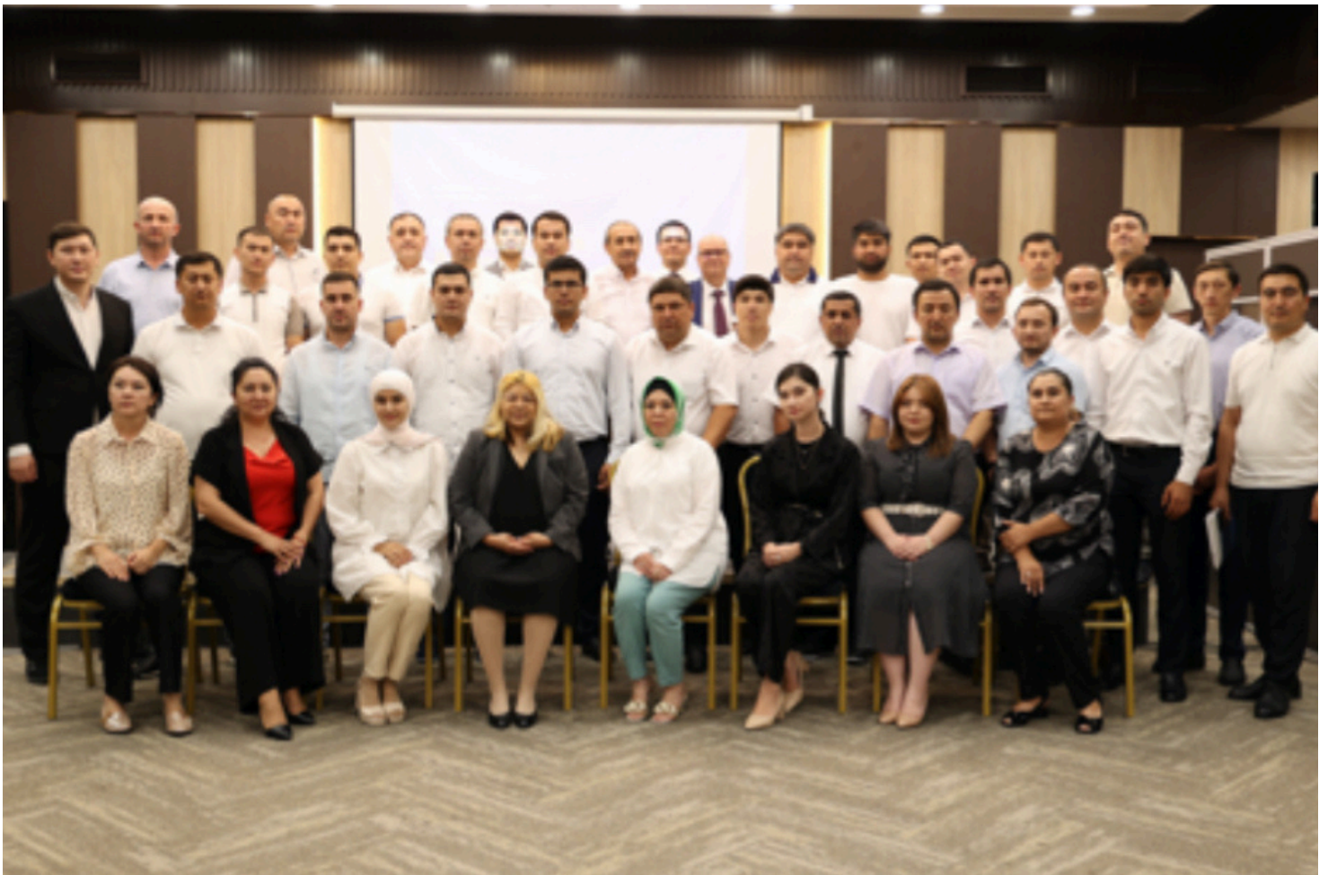
The team of technicians who received training in aspects of TBT along with their trainers in Tashkent, June 2023.

The mission then travelled to Brussels, where they met staff of the EU's National Enquiry Point. A web story on the training and mission gives more information.